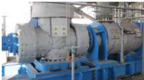
CHEMICAL PLANT - IBP - CRESCENTINO (VC) - ITALY - 2014