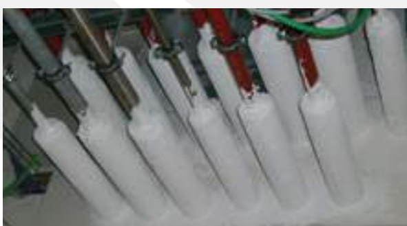
HOSPITAL - ALBA-BRA (CN) - ITALY - 2015/16