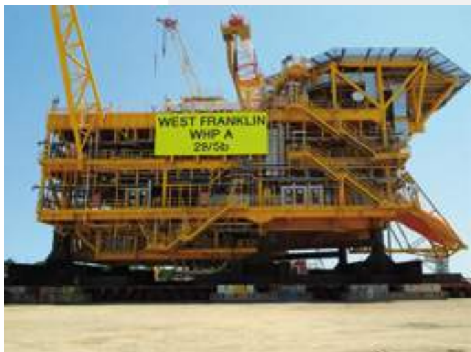
Rosetti Marino SpA – Platform Total West Franklin