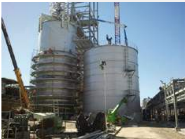
IBP SpA – Bioethanol Production Plant - Crescentino (VC) - Italy