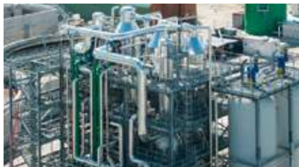
CHEMICAL PLANT - IBP - CRESCENTINO (VC) - ITALY - 2013/14