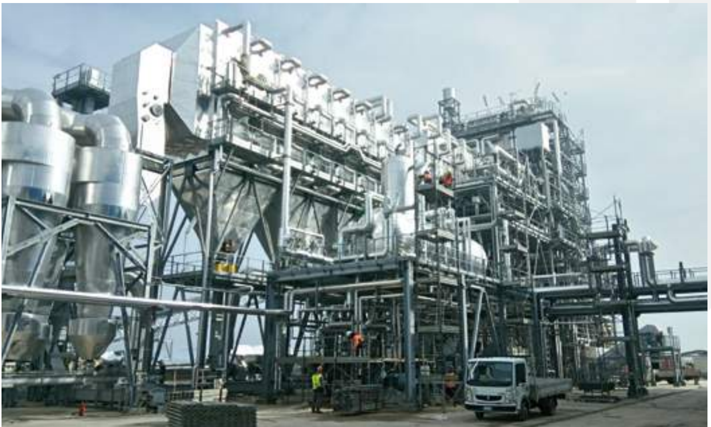
ENEL GREEN POWER - POWER PLANT - FINALE EMILIA (MO) - ITALY - 2015/16

We are proud to have the strength of a medium-sized company while keeping the grit of a start up.