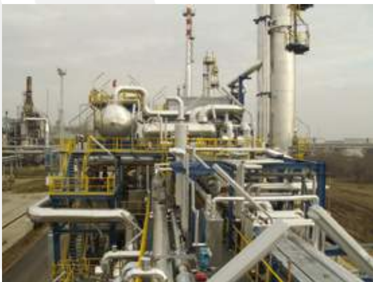
REFINERY MOL DUHA - SZA'ZHALOMBATTA - HUNGARY - 2007/8

The COIVER COIBENTAZIONI TERMOACUSTICHE company share capital is equal to 500k euro with a net worth of more than 1mln euro and open bank credit lines worth more than 2 mln euro with the principle national banks such as: Intesa SanPaolo, Banca Nazionale del Lavoro (BNP Paribas Group), BPER Group and UBI Banca (whereby COIVER GROUP's net worth is more than 20 million euro).