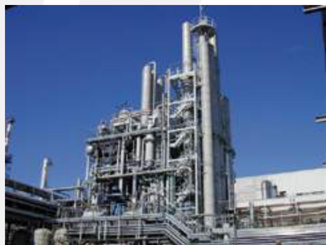
FIS SpA - Alte di Montecchio (VI) – Italy