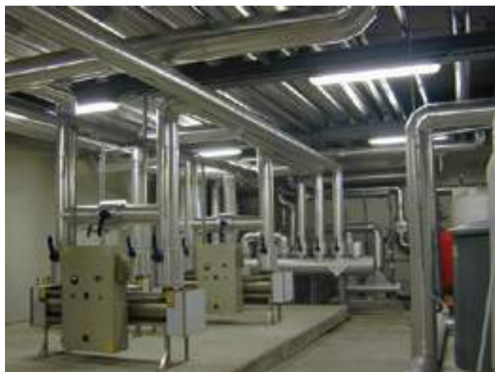
ASTER SpA – Hospital - Lecco - Italy