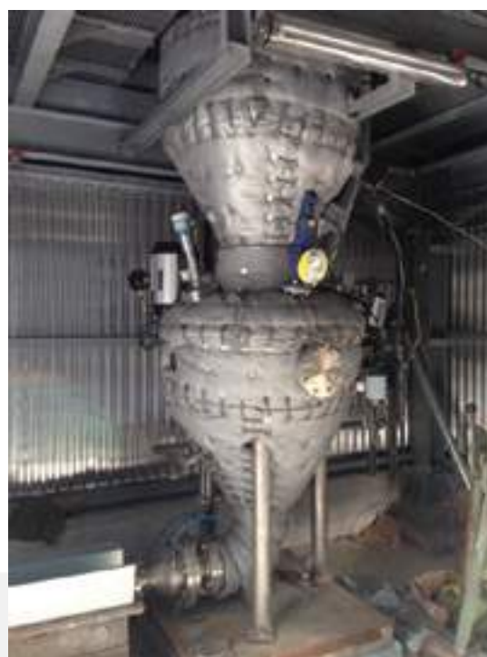
IBP SpA – Bioethanol Production Plant - Crescentino (VC) - Italy