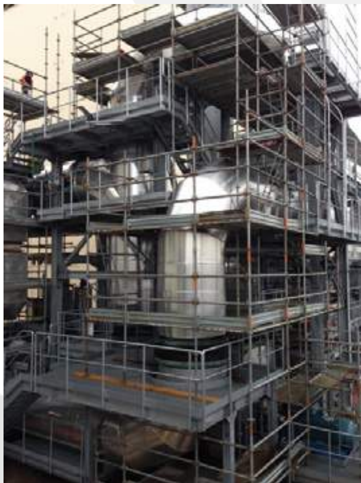
MAGUIN SA – Glass Plant Production - Gazzo Veronese (VR) - Italy