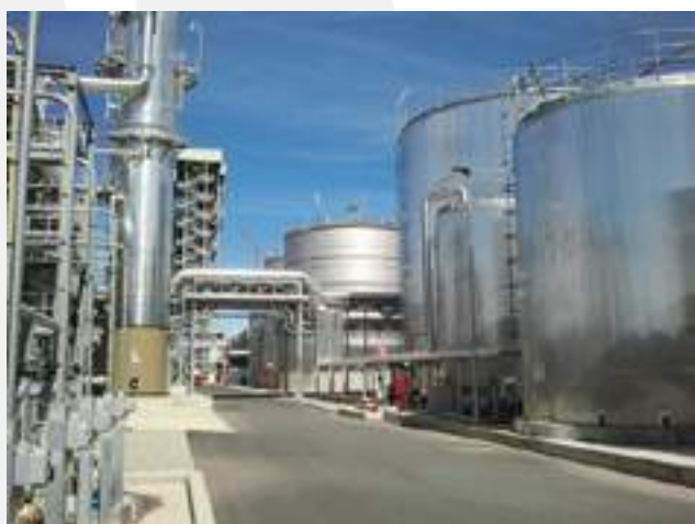
IBP SpA – Bioethanol Production - Crescentino (VC) – Italy