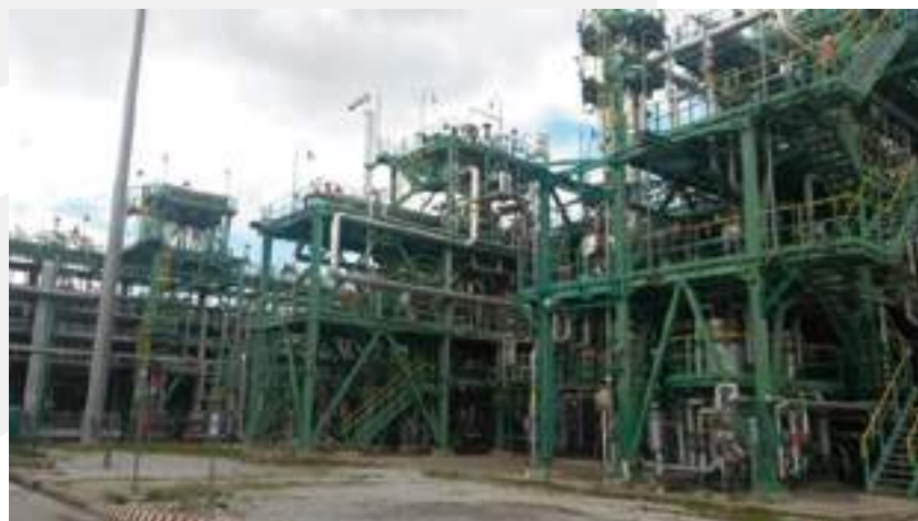
Quinto Treno Scarl - Refinery ENI - Val d'Agri - Viggiano (PZ) - Italy