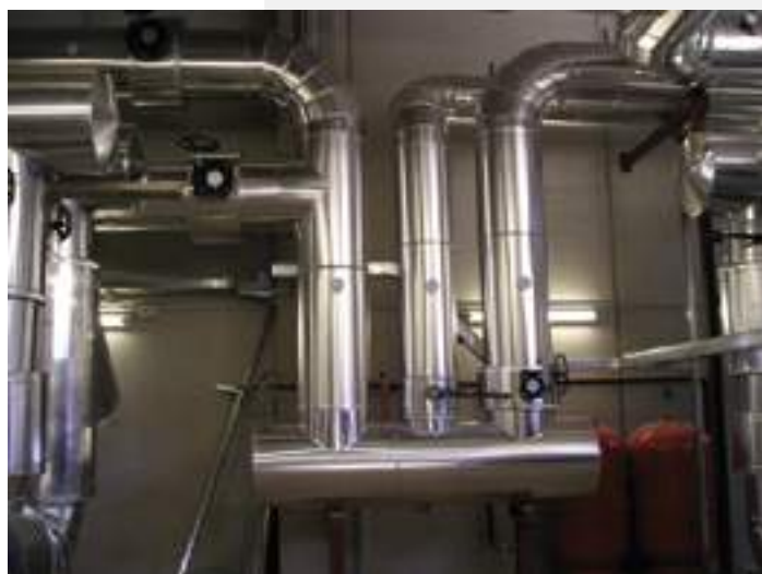
S. CHIARA Scarl – Hospital - Trento - Italy