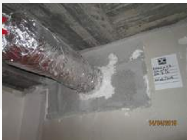
Alba Bra Scarl – Hospital - Alba-Bra (CN) - Italy