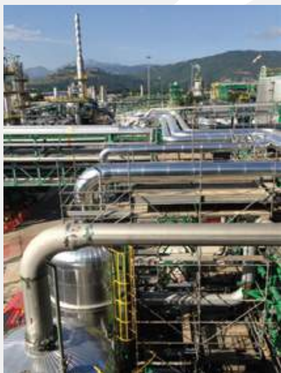
Quinto Treno Scarl - Refinery ENI Val d'Agri - Viggiano (PZ) - Italy