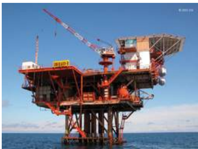
Rosetti Marino SpA – Platform ENI "Barbara B"