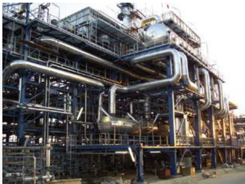
SIIRTE NIGI – Refinery MOL DUNA – Szazhalombatta - Hungary