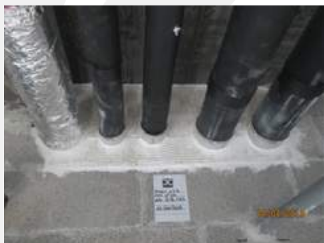
CITIE – Hospital - Massa - Italy