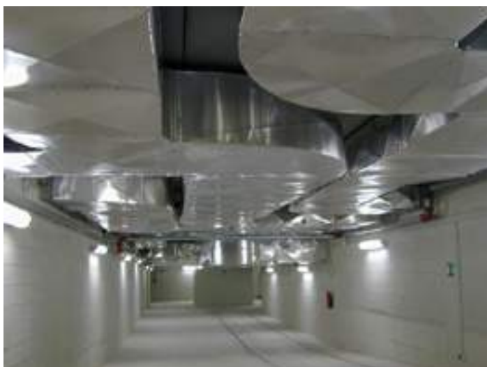
ASTER SpA – Hospital - Lecco - Italy