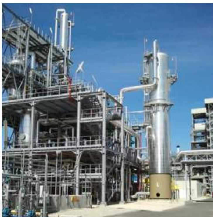
IBP SpA – Bioethanol Production Plant - Crescentino (VC) – Italy