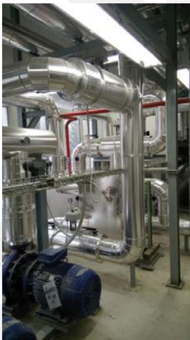
ISOM LAVORI Scarl – Hospital - Bologna - Italy