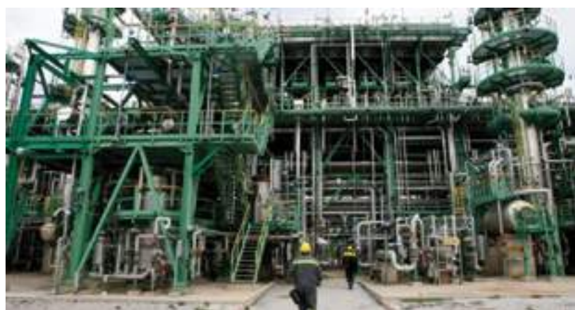
Quinto Treno Scarl - Refinery ENI - Val d'Agri - Viggiano (PZ) - Italy