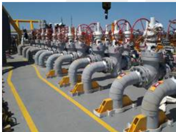
Rosetti Marino SpA – Platform Total West Franklin