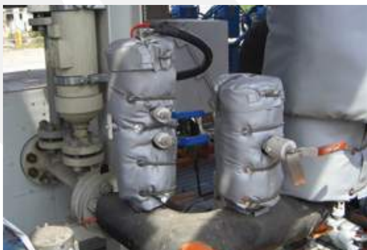
Rosetti Marino Spa – Skid Project - Kazakhstan