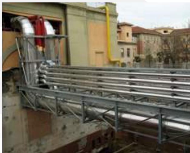
ISOM LAVORI Scarl – Hospital - Bologna - Italy