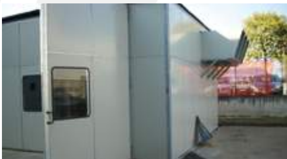
POWER STATION - A2A - MILANO - ITALY - 2014

Hospitals, business centres, airports and railway infrastructures, subways, shopping malls, offices for services and multi-functional centres, hotels & resorts, as well as, residential buildings.