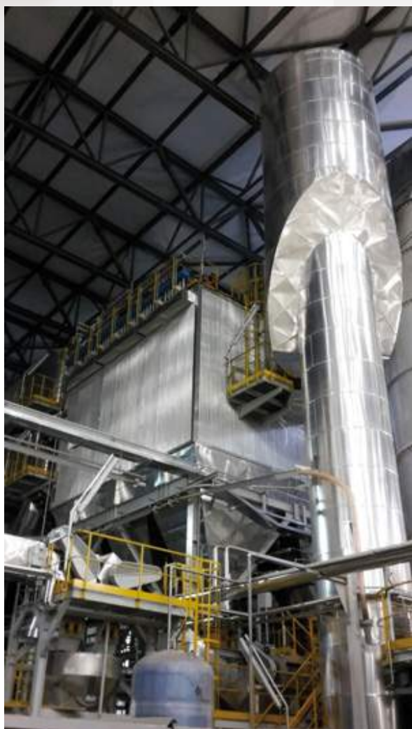
ATS AIR TREATMENT SYSTEM SR Incinerator – Bidgoszcz - Polonia