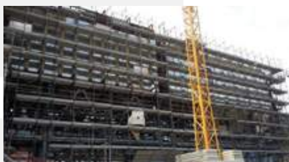
ENEL GREEN POWER - POWER PLANT - FINALE E. (MO) ITALY - 2015/16