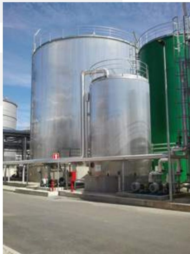
IBP SpA – Bioethanol Production - Crescentino (VC) – Italy