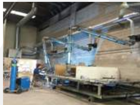
Weld and carpenter work-station