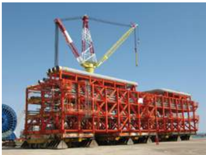
Rosetti Marino SpA – Skid Project Kashagan - Kazakhstan