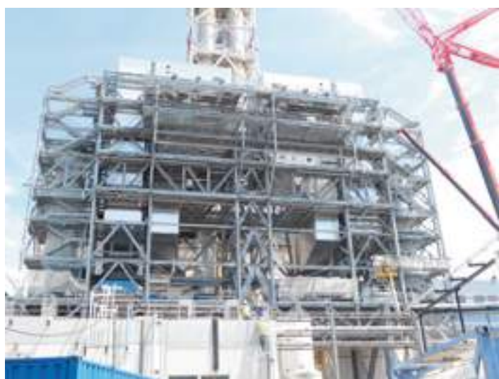
TERMOKIMIK SpA – Power Plant – Fort de France – Martinique