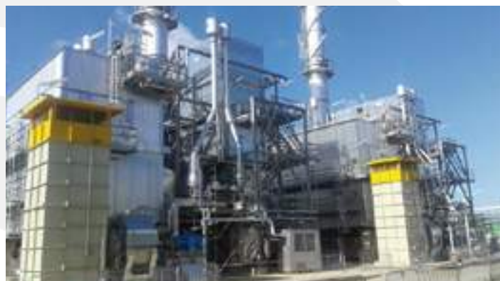
PENSOTTI FCL SpA – Power Plant c/o Lyondel Basel – Rotterdam – Netherland