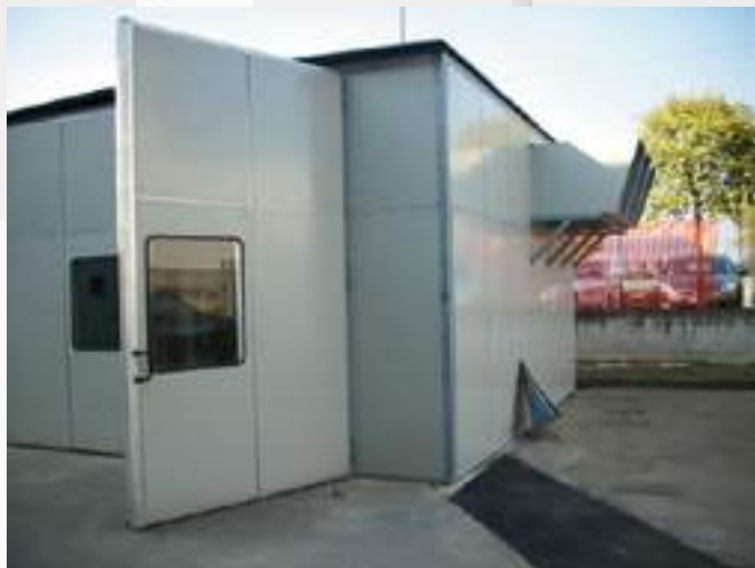
A2A – Power Plant - Milano - Italy