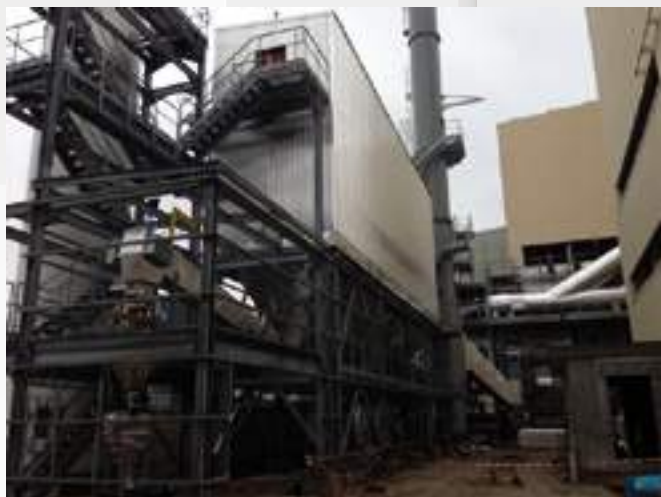
MAGUIN SA – Gas Production Plant - Gazzo Veronese (VR) – Italy