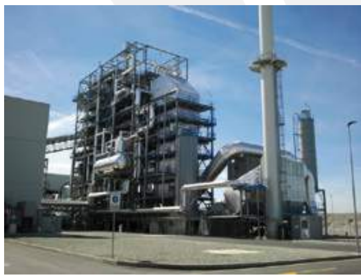
IBP SpA – Power Plant - Crescentino (VC) – Italy