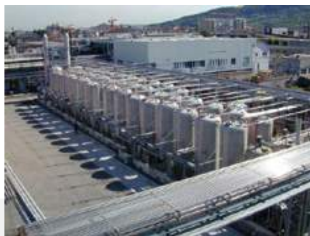
FIS SpA – Storage Tanks - Alte di Montecchio (VI) – Italy