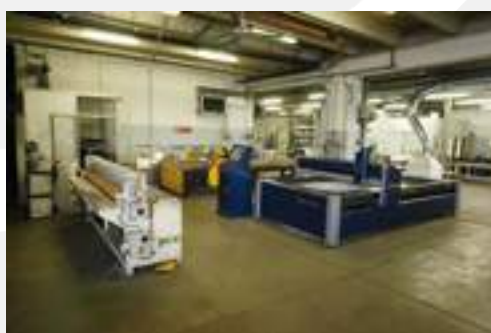
Plasma pantograph cutter