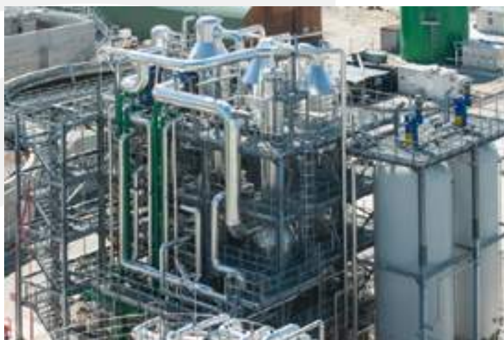
IBP SpA – Bioethanol Production Plant - Crescentino (VC) – Italy