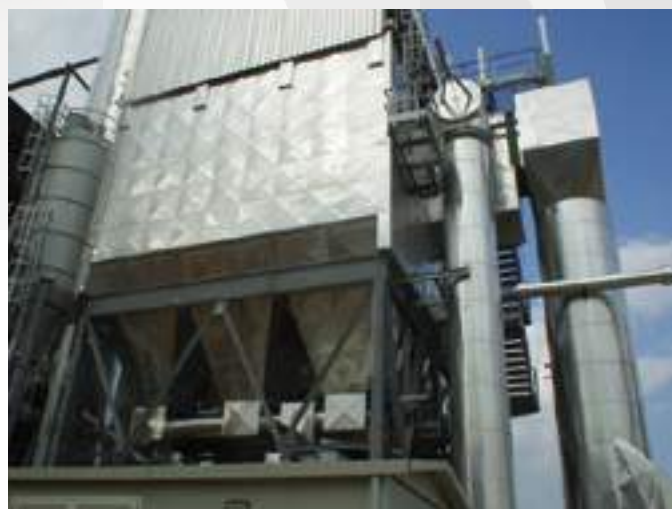
ATS AIR TREATMENT SYSTEM SRL - Cutro (KR) – Italy