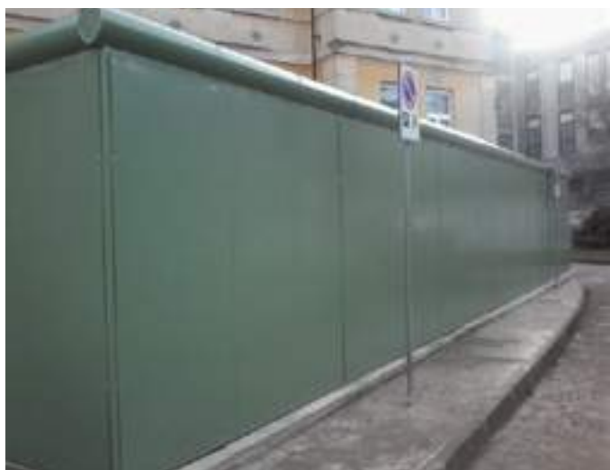
Acoustic Barrier for air-conditioning – Hospital - Alessandria - Italy