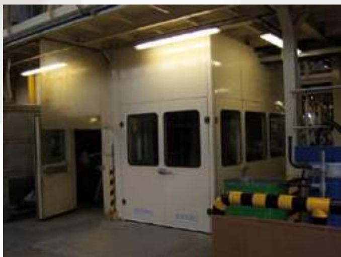
BAYER SpA – Pharmaceutical Plant - Filago (BG) - Italy