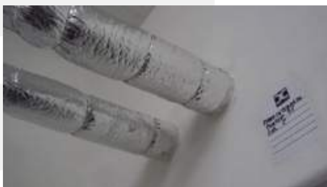
Gemmo Spa – Hospital - Bologna - Italy