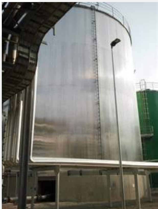
IBP SpA – Bioethanol Production - Crescentino (VC) – Italy