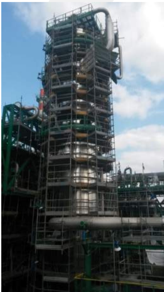
Quinto Treno Scarl - Refinery Plant - Viggiano (PZ) - Italy