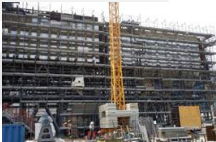
STC POWER Srl – Biomass Boiler Enel Green Power - Finale Emilia (MO) – Italy