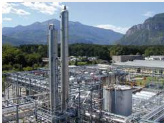
Sandoz Industrial Products Spa - Rovereto (TN) – Italy