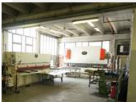
Bender and shears machine