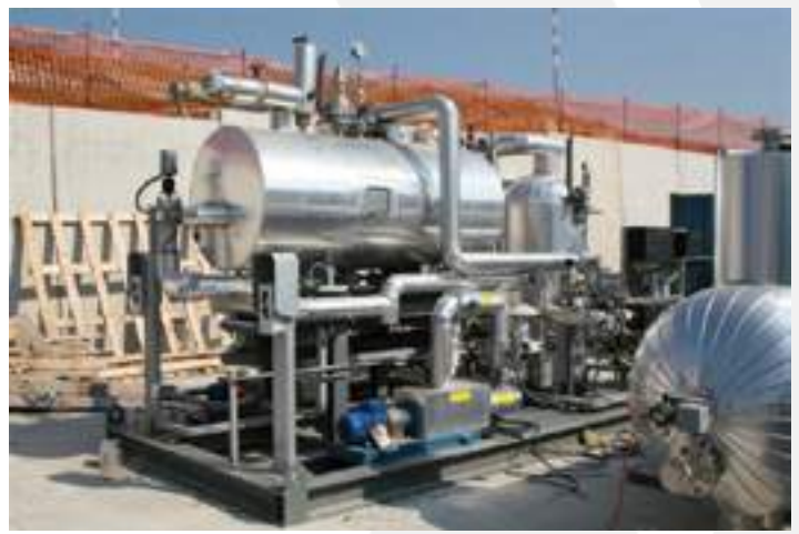
SIIRTEC NIGI – Skid - Civitavecchia (Roma) - Italy