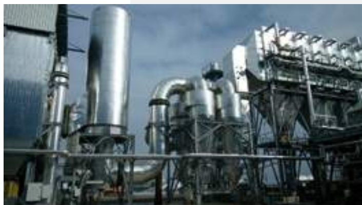
STC POWER Srl – Biomass Boiler Enel Green Power – Finale Emilia (MO) - Italy