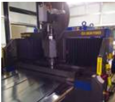
Punching machine with continuous feed from coil and axis interpolation

All of the products we manufacture are produced and/or assembled in our manufacturing plant in Milan (Cormano) by highly professional and experienced staff under the supervision of our Head of Production respecting the highest quality assurances and ISO requirements. Thanks to the equipment including machines and technologies (e.g. punching multi-tool in a continuous loop from coils with interpolations axis, CNC bending machines, guillotine shears, work center for carpentry and welding, plasma pantograph, cutting line from coils for ribs, cutting line and calendering for pipes, pneumatic flanging machines, clip boxes, recently renovated) we are able to work with aluminium, stainless steel, galvanized steel and iron, manufacturing our products according to the needs, even customized, of our Clients and/or projects.