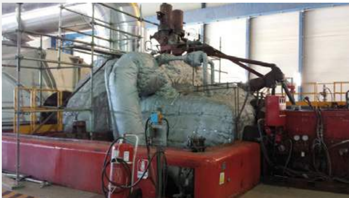
ALSTOM POWER – Power Station E.ON - Fiume Santo (SS) – Italy