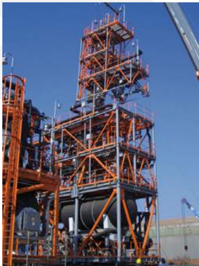
Siirtec Nigi SpA – Skid Project Kashagan - Kazakhstan