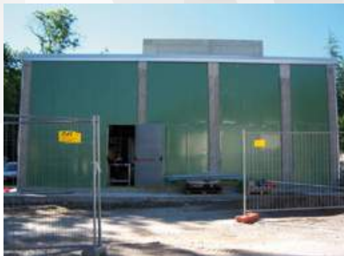
Centrale Termica – Power Plant - Hospital - Desio (MI) - Italy