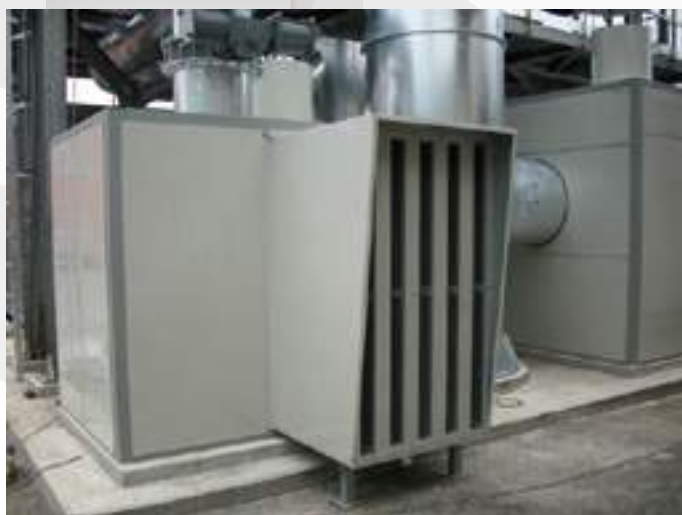
EUTICALS – Fans - Casale L.no (LO) - Italy