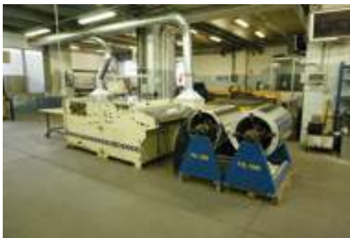
Cutter machine with rib tool