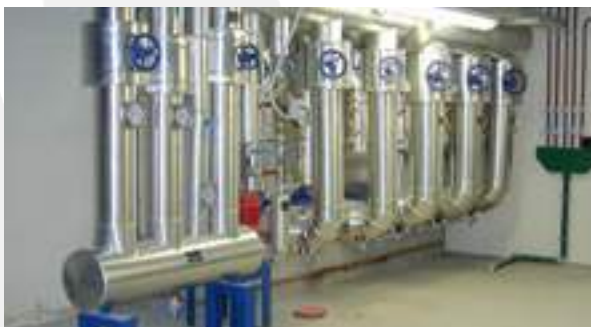
PHARMACEUTICAL INDUSTRY - ORIGGIO (MI) - ITALY - 2007