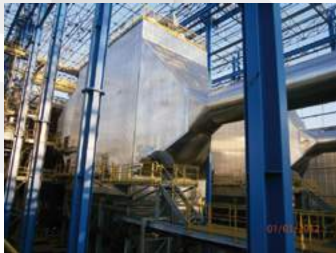
CNIM SA – Incinerator - Torino – Italy