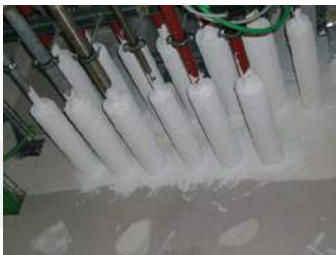
Alba Bra Scarl – Hospital - Alba-Bra (CN) - Italy